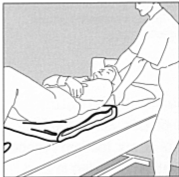
1. Preparing patient for a move

The SST Slide Medium is placed under the part of the patient's body to be moved. The center of the SST Slide Medium should cover the heaviest or lowest lying part and lie so that it will slide against itself in the direction of the intended movement (fig. 1). It is best to place the SST Slide underneath a draw-sheet, which is then pulled to move the patient. The easiest way to remove the SST Slide is to pull on the lower part of it and allow it to slide out, taking advantage of the slick inner coating. When doing this, you should hold one hand against the patient's body so that the patient remains stationary (fig. 2).