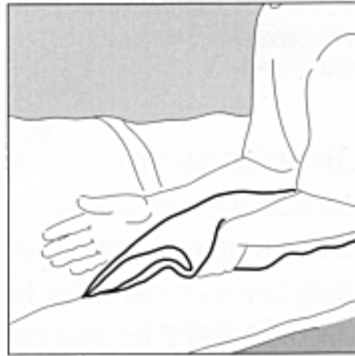
2. Keeping a hand against the patient when removing the sliding mat