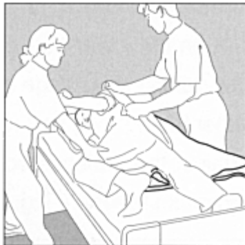
7. Turning a heavy and passive patient