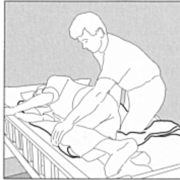
5. A heavy and partially active patient