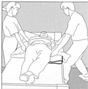
3. Turning a heavy and passive patient

The SST Slide Medium is best suited for the patient who needs help under a hip and/or shoulders. To achieve maximum benefit, position the sliding mat under the heaviest parts of the patient's body, so that the direction of the transfer is aimed up toward the head of the bed.