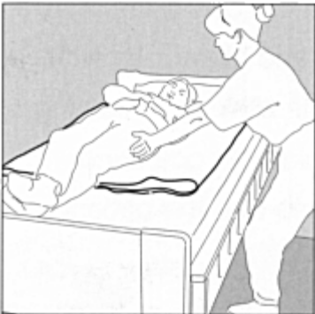
6. Preparing a patient to be repositioned