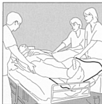
4. Differing levels between transfer surfaces