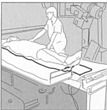
3. A uniform-level transfer, with an overlapping draw sheet around the patient

If there is a difference in levels (fig. 4), pillows or blankets may be placed under the mattress at the edge of the lower surface to create an inclined plane and allow a gentle transition.