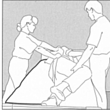
6. Handling a heavy and passive patient who may be sensitive to pain